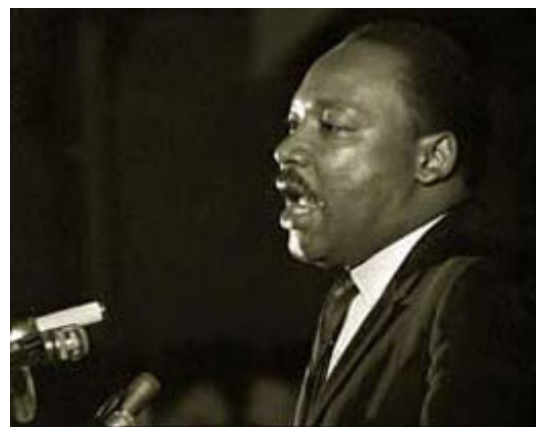
Dr. King makes his last public appearance at the Mason Temple in Memphis, Tennessee, a day before his assassination on April 4, 1968.