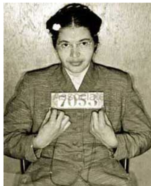
A booking photo of Rosa Parks taken February 22, 1956.

On December 1, 1955, Parks was employed as a seamstress at a local department store. When she rode home from work on that afternoon, she sat in the first row of the "colored section" of seats between the "white" and "black" rows. When the white seats filled, the driver ordered Parks to give up her seat when another white person boarded the bus. Parks refused. She was arrested, jailed, and ultimately fined $10, plus $4 in court costs. Parks was 42 years old; she had crossed the line into direct political action.