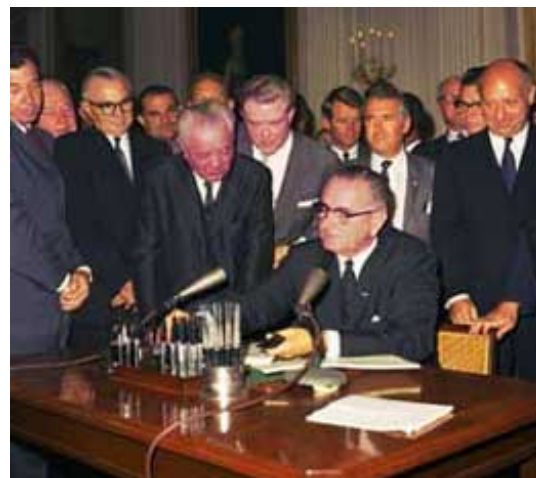
President Lyndon Johnson - surrounded by senators and representatives -- signs the civil rights bill, July 2, 1964, in the East Room of the White House.

Ever since post-Civil War Reconstruction failed to ensure the civil rights of blacks in the American South, two great obstacles had blocked efforts at the national level to end Jim Crow: the political party system and the rules of the U.S. Congress. When the United States acquired vast and potentially slaveholding territories (including California and much of today's American Southwest) in the Mexican War of 1846-1848, the nation's political parties increasingly formulated their positions on sectional lines: Democrats favored the South, and the expansion of slavery; Whigs, and later Republicans, favored the North, opposed the extension of slavery into the newly acquired territories, and often believed that complete abolition was only a matter of time. Whigs and Republicans in this era favored the aggressive use of federal power to promote economic development. Southerners and Democrats — fearing federal action against slavery — favored the supremacy of individual states against a federal government properly limited to only those powers specifically granted by the Constitution. This "states' rights" concept has deep roots in American history. Early in