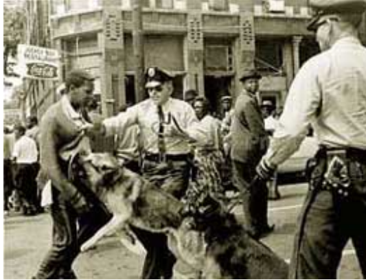
A civil rights demonstrator in Birmingham, Alabama, is attacked by a police dog on May 3, 1963.

installed pastor of the Dexter Avenue Baptist Church, King was just 26 years old but he had been born to leadership: His father, the Reverend Martin Luther King Sr., headed the influential Ebenezer Baptist Church in Atlanta, was active in the Georgia chapter of the NAACP, and had since the 1920s refused to ride Atlanta's segregated bus system.